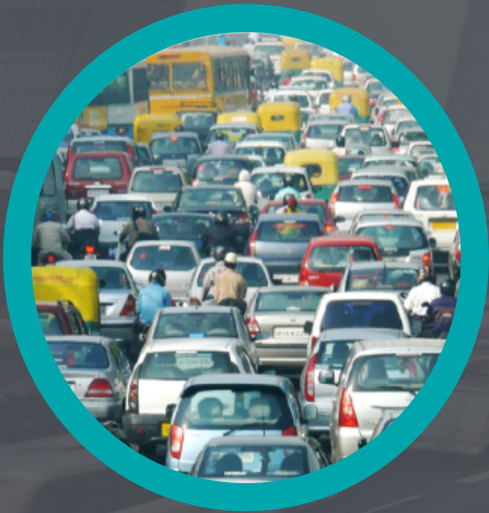
Rise of the city